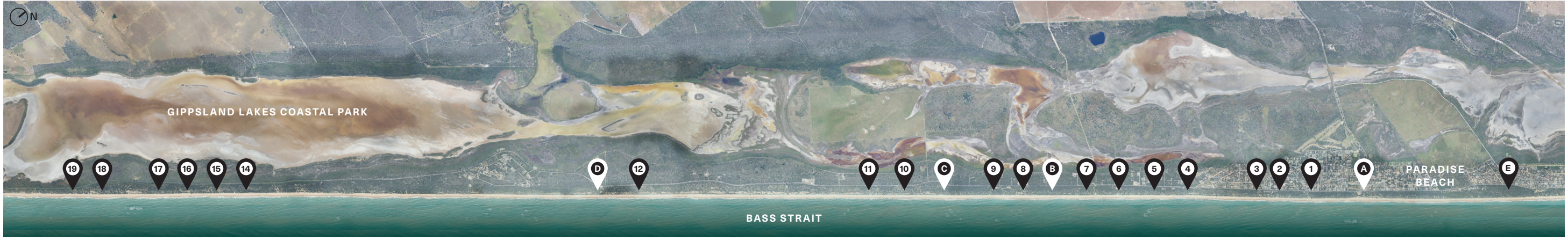
Camgrounds and Day Visitor Sites