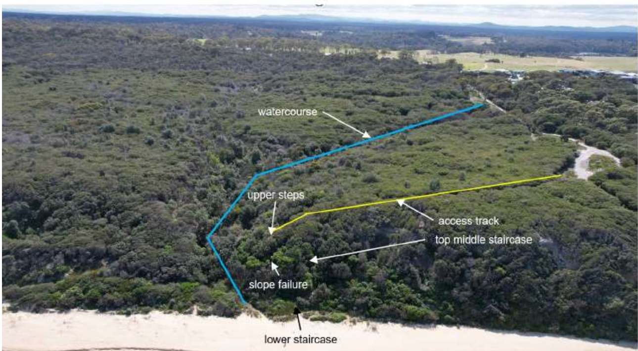
Figure 2: Drone photo from ocean looking north