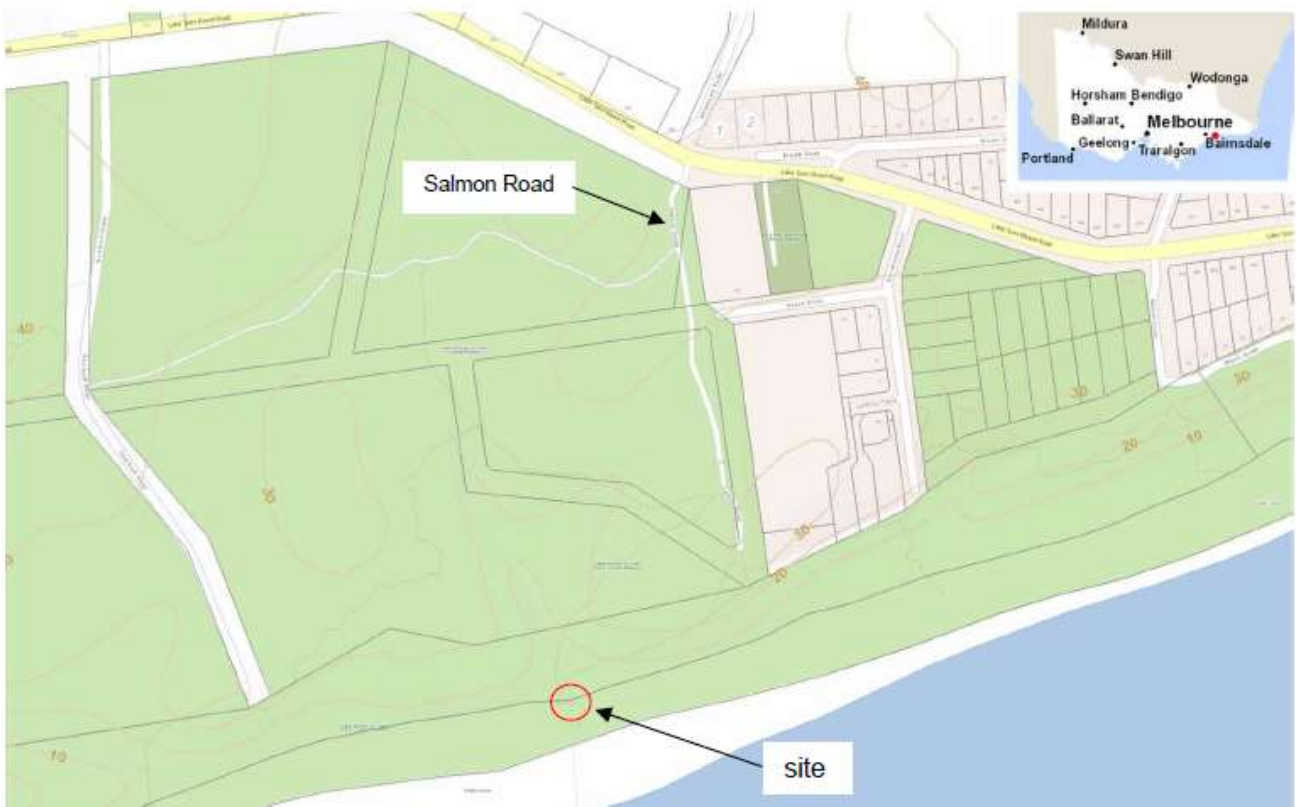
Figure 1: Location of repair work