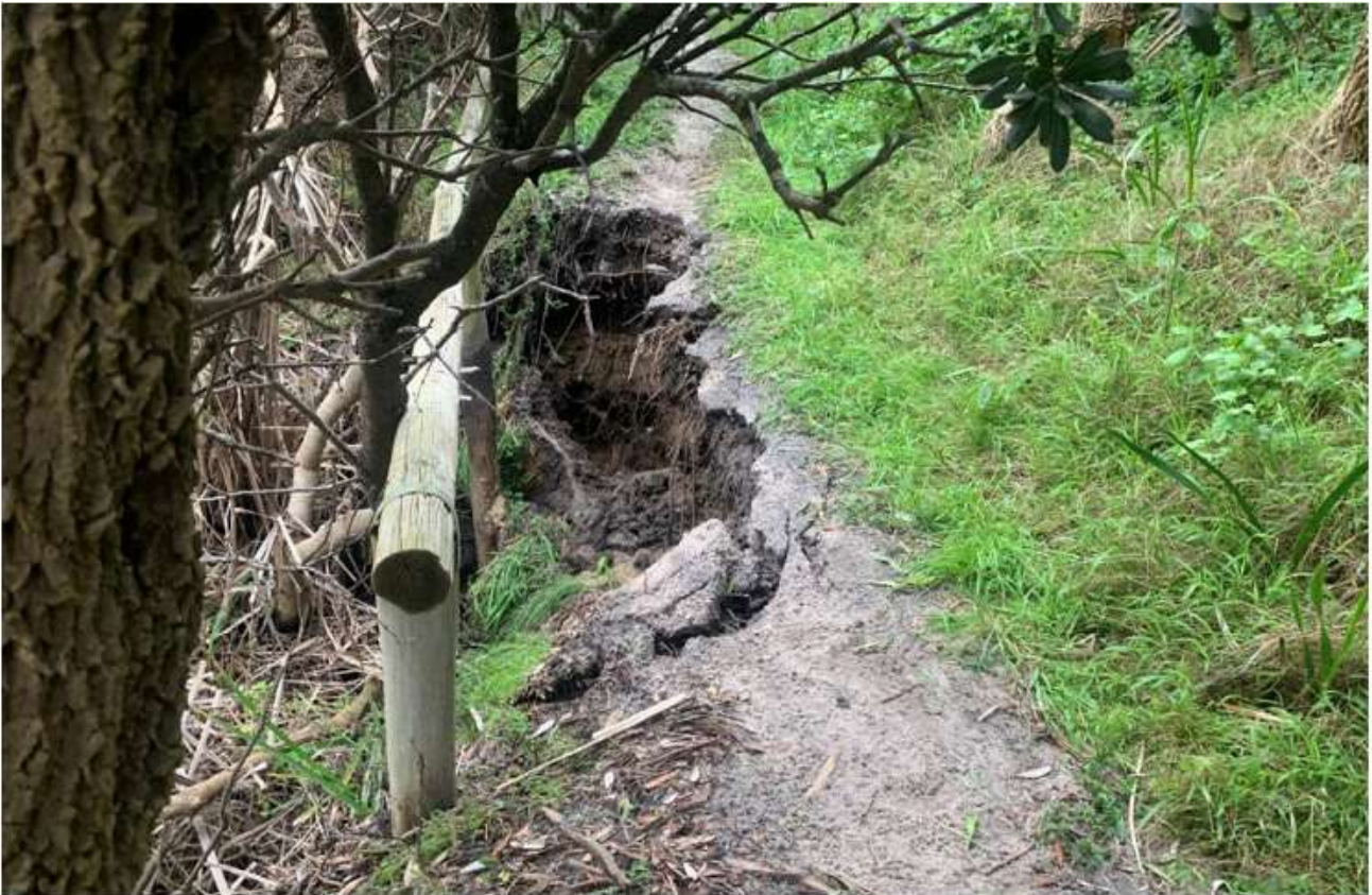
Figure 3: Photo of section of walking track to be repaired with a boardwalk