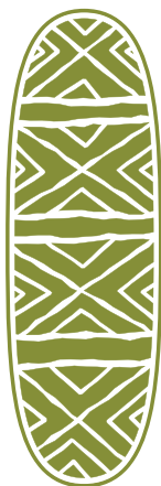
Brayakaulung around the current area of Sale.