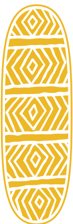
Brataualung people in South Gippsland.

We have a strong and living culture, a stable and growing corporation, and our rights to Country and the natural resources it contains have been legally recognised. We have built the foundations to heal wounds from the past and rebuild our heritage, culture and people. We are in a strong position to move forward to build a better future for our community.