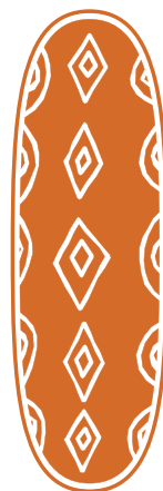
Tatungalung near Lakes Entrance on the coast.