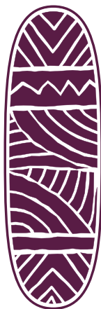
Brabralung people are from Central Gippsland.