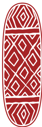
Krauatungalung people near the Snowy River.